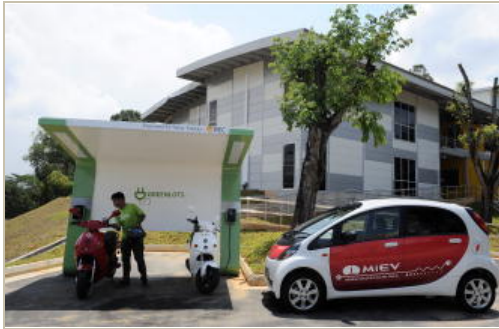
Electric vehicle charging infrastructure provider Greenlots has already set up 10 electric vehicle charging points in Singapore.